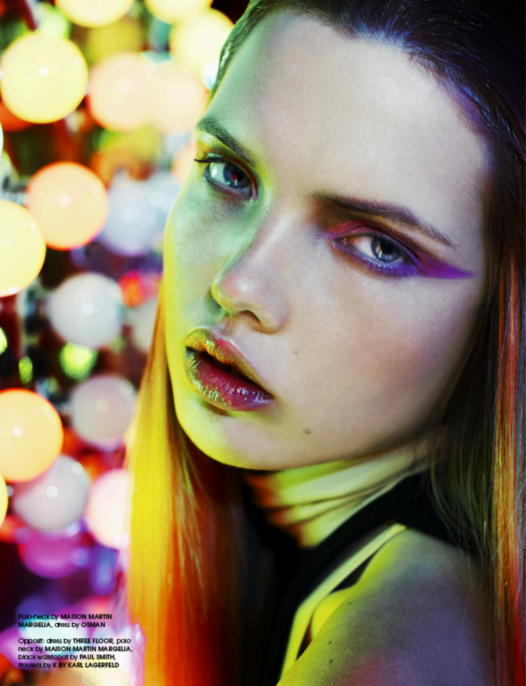
Polo-neck by MAISON MARTIN MARGELIA, dress by OSMAN