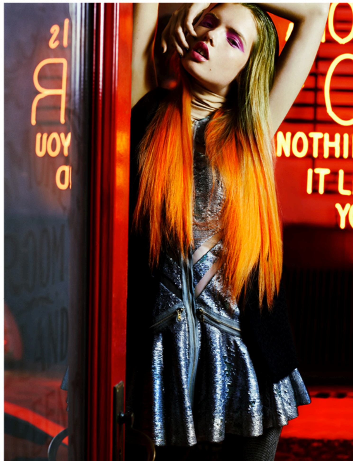
Opposit: dress by THREE FLOOR, polo neck by MAISON MARTIN MARGELIA, black waistcoat by PAUL SMITH, trousers by K BY KARL LAGERFELD