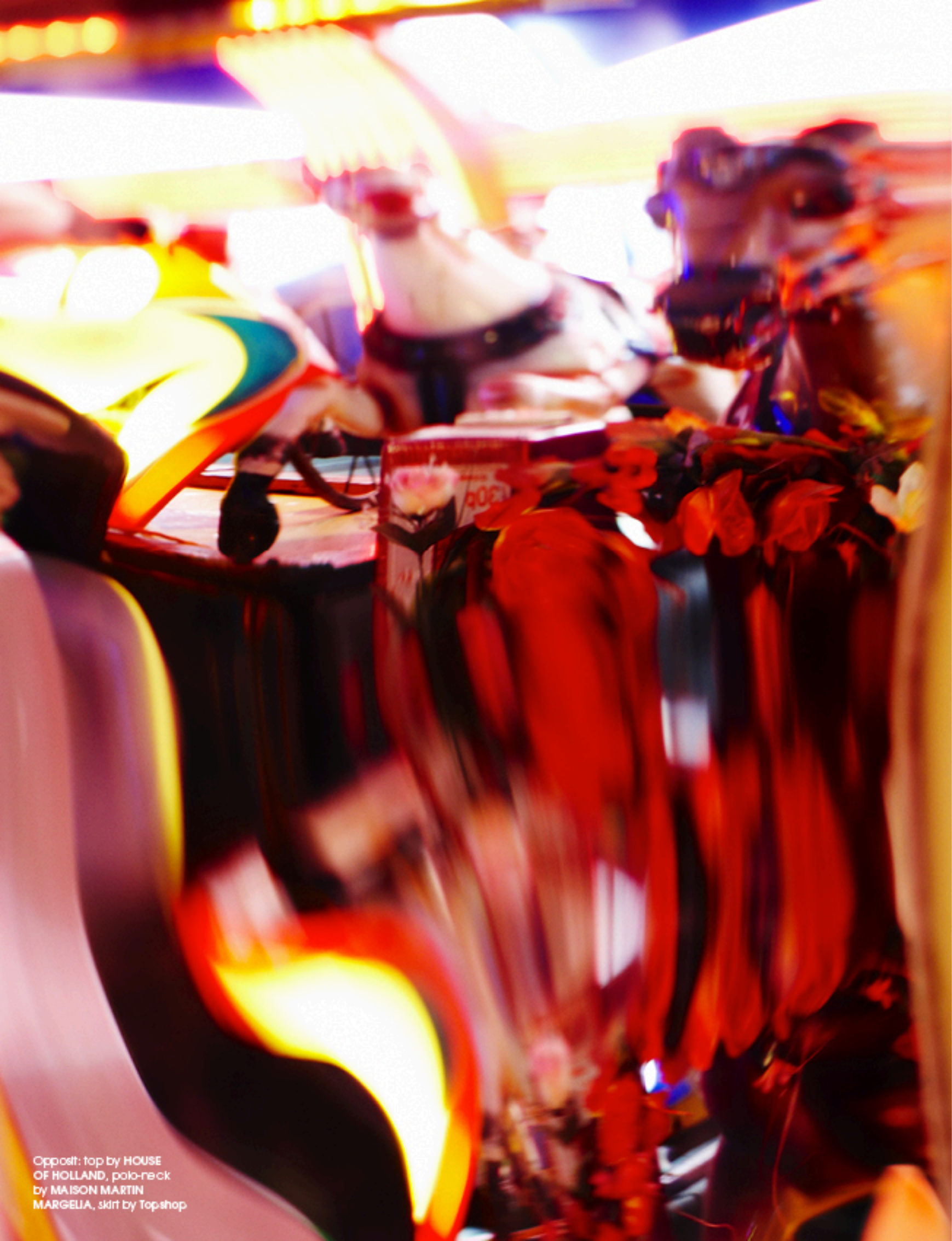
Opposit: top by HOUSE OF HOLLAND, polo-neck by MAISON MARTIN MARGELIA, skirt by Topshop